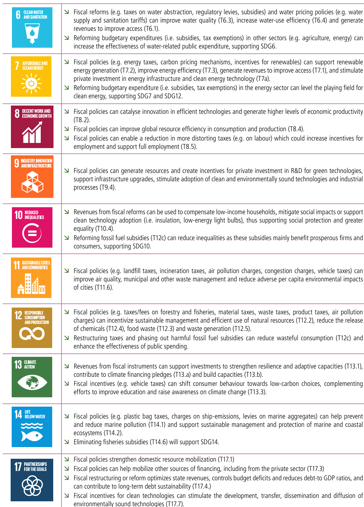
Table 1: Overview of how fiscal policies can support delivery of multiple SDGs 4